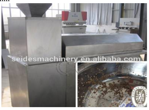
Fig1:Tomato seed remover FQS-1